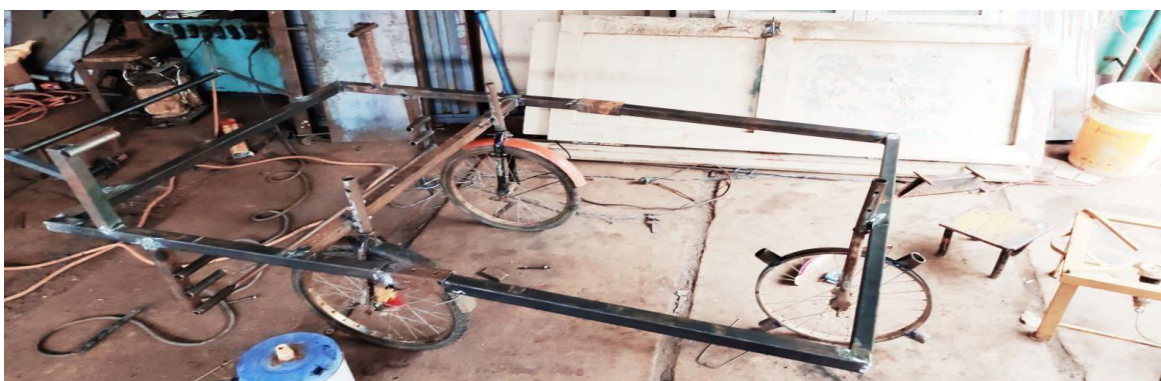
(b) Actual model